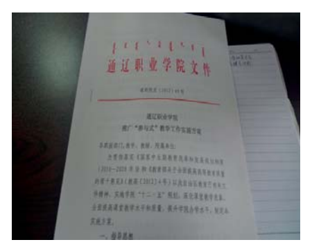
Red-letter Title Document for implementing CRC in TVC