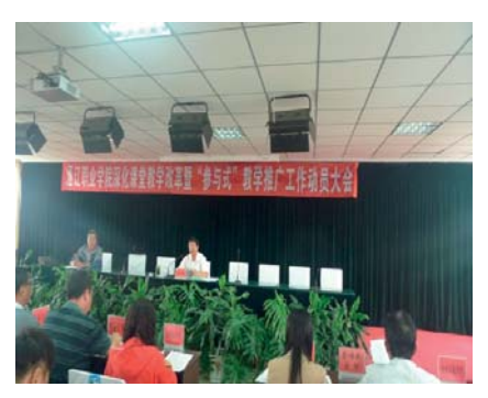
Launch of participatory teaching method in TVC

izing model classes, the other is to set up the research subject project on the topic of The Promotion and Application of Participatory Teaching in Higher Vocational Colleges which consists of 10 sub-projects of different majors.