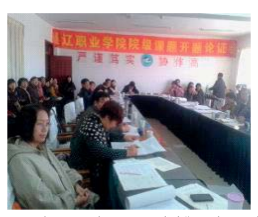
Setting up the research project titled "On the Study of Popularization and Application of Participatory Approach in Vocational College".

advanced experience on participatory approach, having all kinds of training lectures to make teachers to better understand the significance of spreading participation teaching approach and to improve the ability of application in classroom teaching ,applying participatory approach to the classroom teaching based on the characteristics of different subjects and all sub-subjects are being conducting independently based on the different characteristics of subjects.