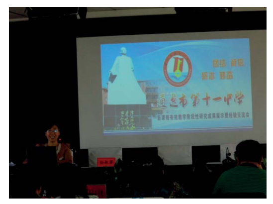
Ms. Sun's lecture on participatory method