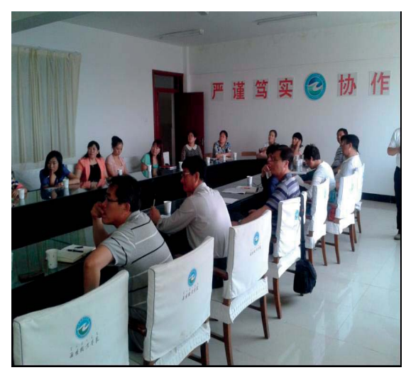
The meeting about the results of the promotion and application of participatory teaching method in Higher Vocational Colleges.