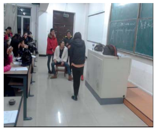
Students' performance in CRC class.

our students, primary school teachers and parents, which are very helpful for our CRC teaching material compilation.